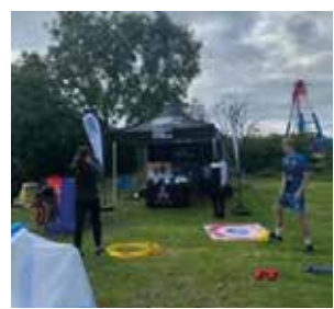
Nufoundation - football skills