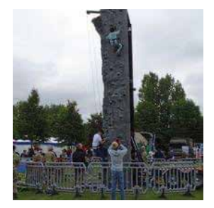
The Royal Regiment of Fusiliers - climbing wall, assault course, paint ball target, hang on the bar competition