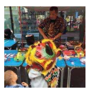
Arts and Crafts